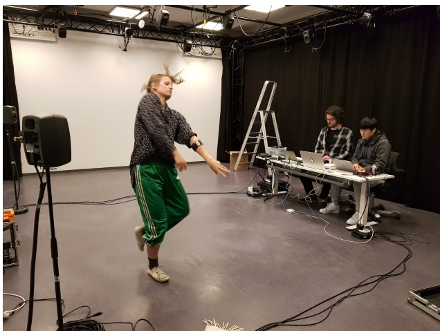
Figure 4: The dancer, the musician and the second musician in a rehearsal.

Her impressions about co-performing on the same instrument is described as “playing together while accessing each other’s skills.” She uses the Norwegian word “vrengt,” which she exemplifies as the act of turning a sweater outwards, pointing to how the artistic intentions and skills are merged together. Furthermore, she emphasizes how each different sound object has a distinct image in her mind (see Table 1) and she “examined the duration, pace and consistency of every movement within them.” Reflecting on the use of abstract algorithms for sound synthesis, she comments that they resemble shapes that she can “fill with any image you want.” This can be seen as opposed to more straightforward sonic imagery of physics-based models. Moreover, she cannot choose one or the other technique in terms of the level of engagement and embodied control. It is an important user-centered aspect, which should be further investigated.