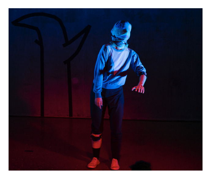
Figure 1: The dancer, blindfolded, in the first live performance of Vrengt.

NIME'19, June 3-6, 2019, Federal University of Rio Grande do Sul, Porto Alegre, Brazil.