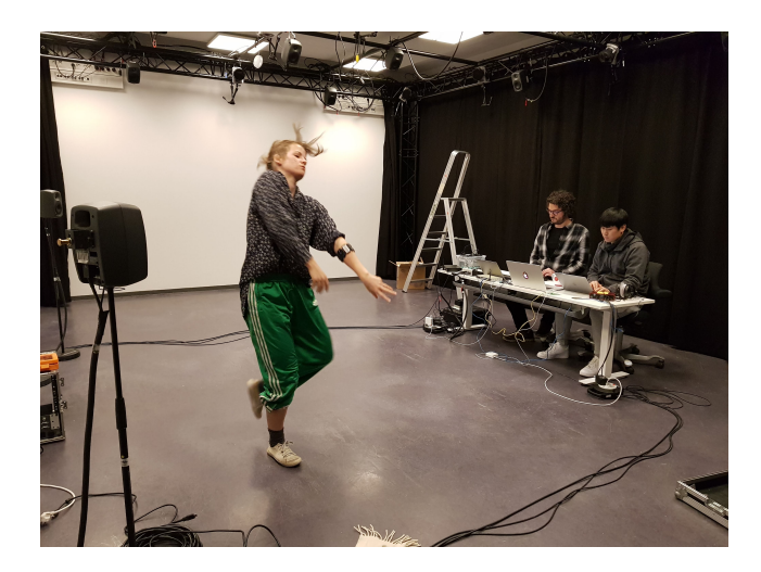
Figure 4: The dancer, the musician and the second musician in a rehearsal.

Her impressions about co-performing on the same instrument is described as "playing together while accessing each other's skills." She uses the Norwegian word "vrengt," which she exemplifies as the act of turning a sweater outwards, pointing to how the artistic intentions and skills are merged together. Furthermore, she emphasizes how each different sound object has a distinct image in her mind (see Table 1) and she "examined the duration, pace and consistency of every movement within them." Reflecting on the use of abstract algorithms for sound synthesis, she comments that they resemble shapes that she can "fill with any image you want." This can be seen as opposed to more straightforward sonic imagery of physics-based models. Moreover, she cannot choose one or the other technique in terms of the level of engagement and embodied control. It is an important user-centered aspect, which should be further investigated.